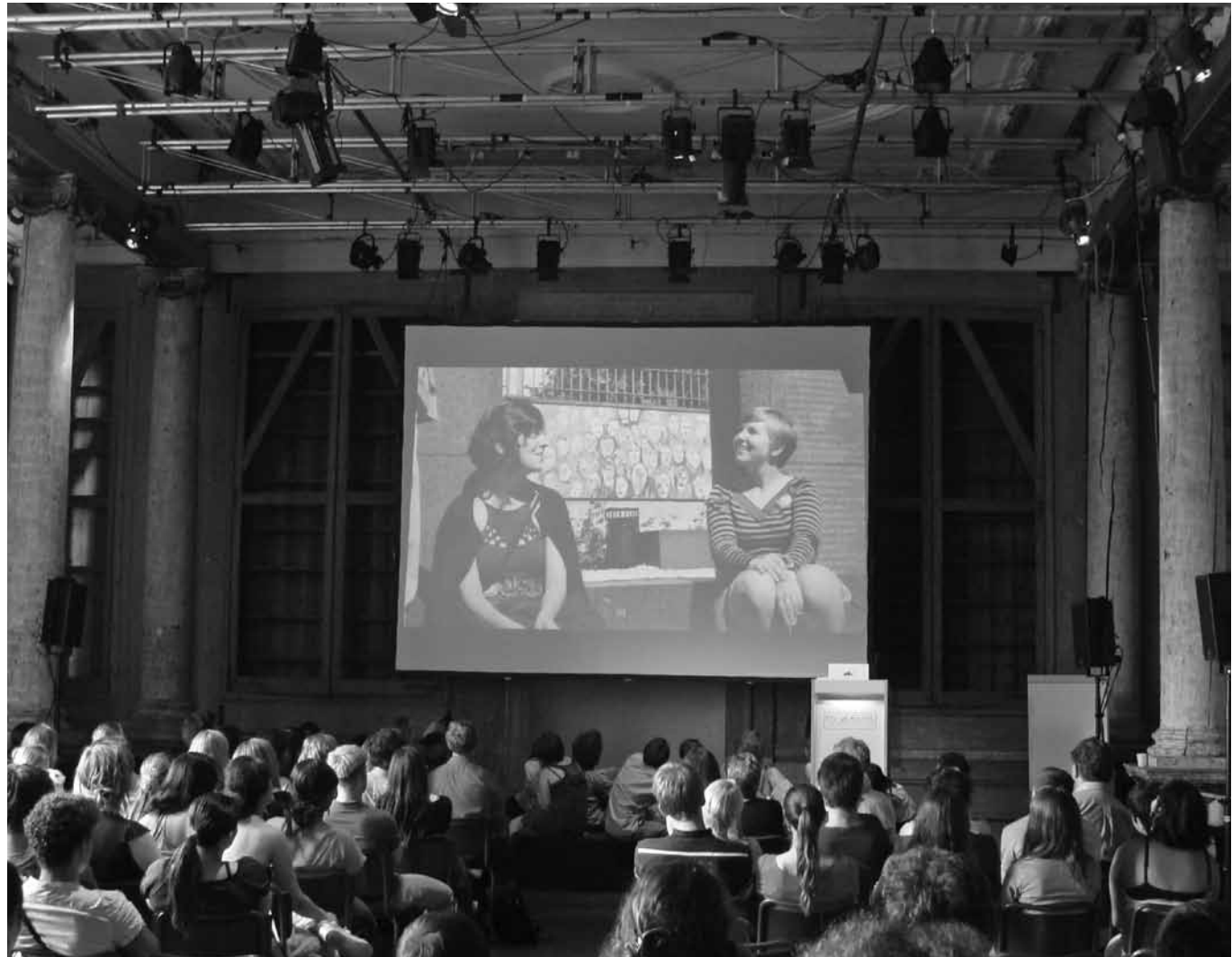
2010 Fellows at the First Annual Humanity in Action International Conference in Amsterdam.